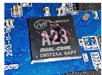
Allwinner A23 Dual-Core in a Chinese Tablet