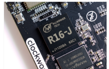
An Allwinner R16-J

The R Series Chip has been applicable to a number of different industries including Industrial Automation , Safe PLCs , Power Generation and Distribution , Healthcare and Automotive Technology . [22] The technology, specifically the R16 Chip, has also been utilised for robotic vacuums, Nintendo Classic Mini systems and smart speakers resulting from a longterm partnership with the Cogobuy Group's subsidiary IngDan (硬蛋). [23]