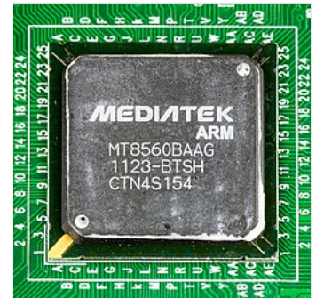
A MediaTek MT8560BAAG inside a Blu-ray player

MediaTek is developing an Arm-based PC chip for Microsoft's Windows, set to launch after Qualcomm's exclusivity ends in 2024. This move aims to challenge Apple's Arm-based Macs and Intel's dominance in the PC market. Nvidia and AMD are also working on similar Arm-based designs for Windows. [62]