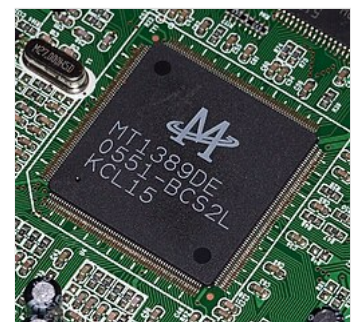
A Mediatek MT1389DE inside a DVD player